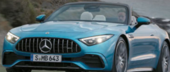
European image shown.